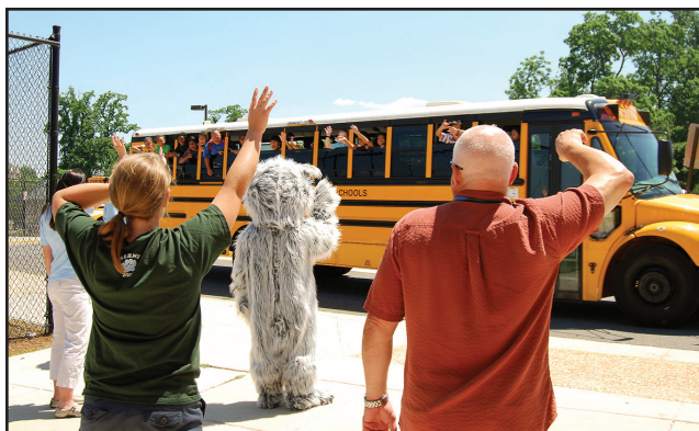
The Mary Ellen Henderson Husky and staff wave goodbye to students as the final bus pulls away on the last day of the 2009-2010 school year. The bus is due to return on September 7th.